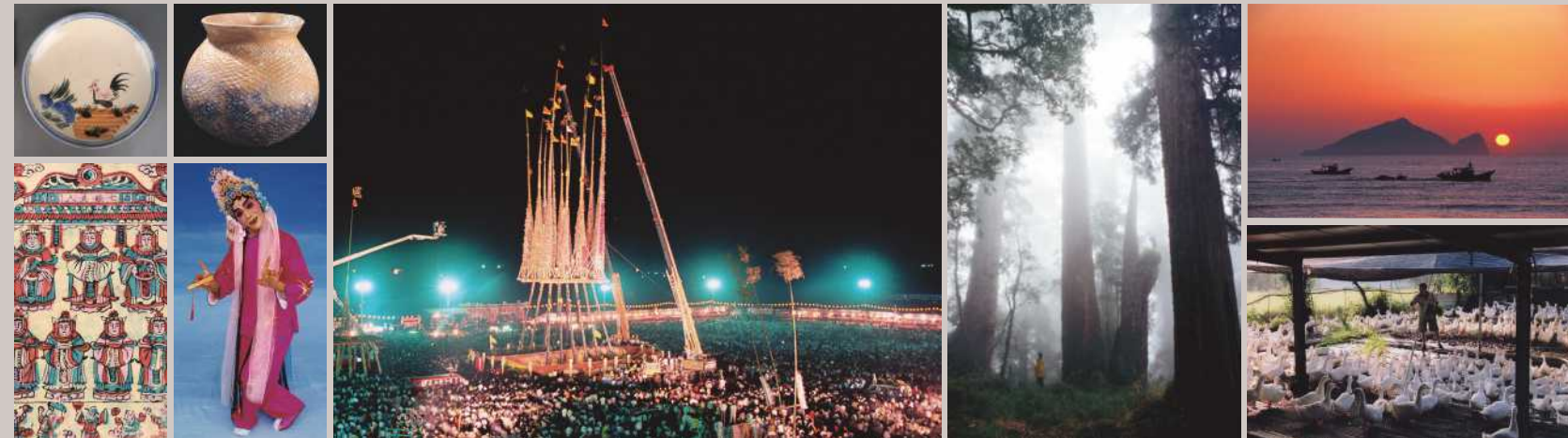
Upper left to right Colored rooster plate Geometric stamped ornamentation pottery excavated from the Ki-Wu-Lan Site Toucheng Qianggu Ghost Festival Chilan Mountain Cypress Forest The Guishan Island

The seasonal festivals are other attractions of Yilan. The “Happy New Year in Yilan” event held in winter is the only one Lunar New Year celebration that invites citizens to gather together and eat Lunar New Year's Eve dinner. The Green Expo held in spring aims at promoting ecological sensitivity. The “International Children's Folklore & Folkgame Festival, Yilan” held in summer has started since 1996 and is a significant activity of CIOFF, an organization in official partnership with UNESCO. The “Jiaosi Hot Spring Festival” and “Yilan Forever Young Festival” held in autumn merge tourism and local life while putting emphasis on healthcare and elderly care.